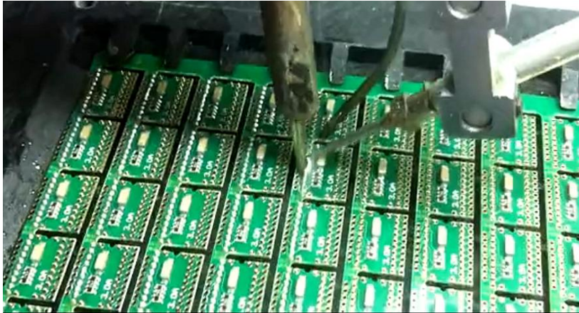
digital frequency display